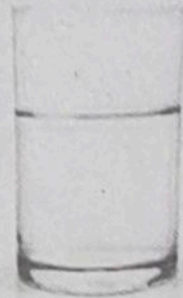
Water in a glass

(When water becomes very cold, it changes into ice)