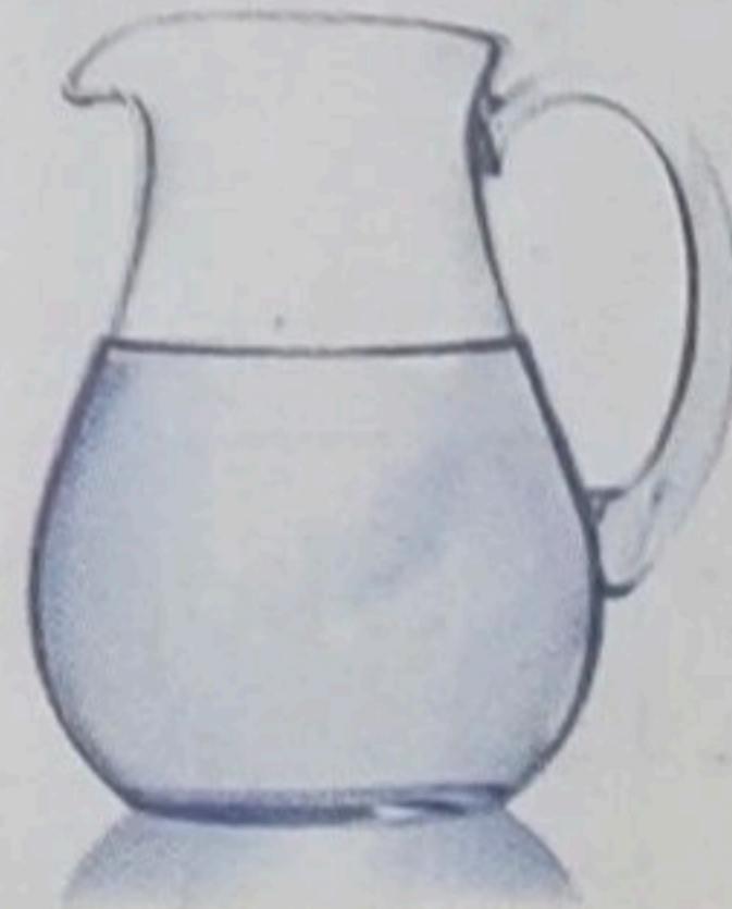
Water in a jug