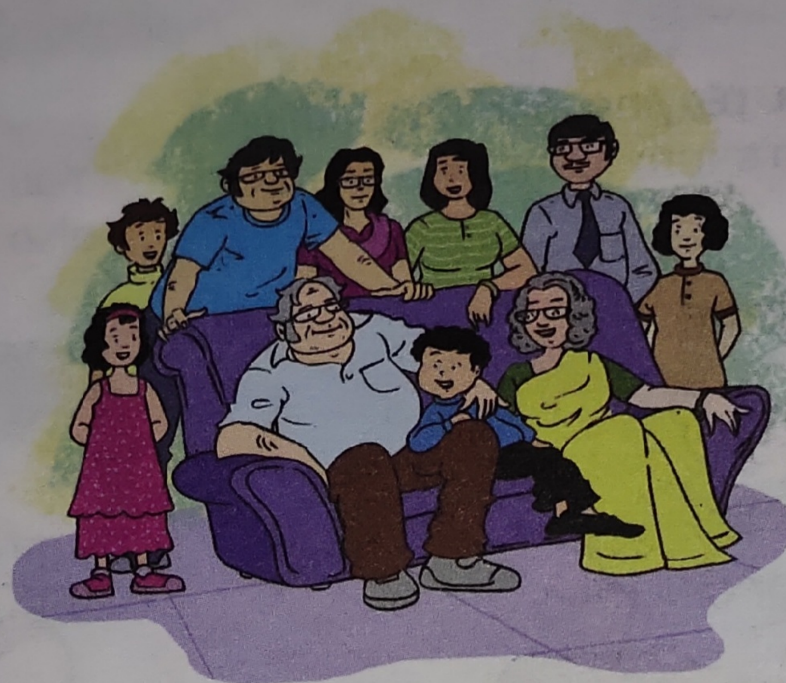
▲ A joint family