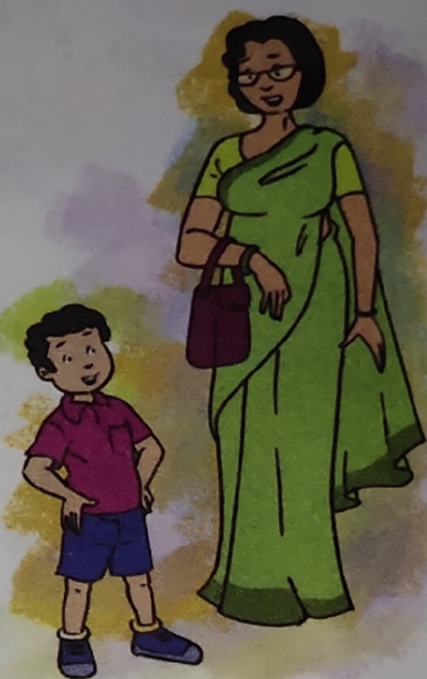
▲ A single parent family