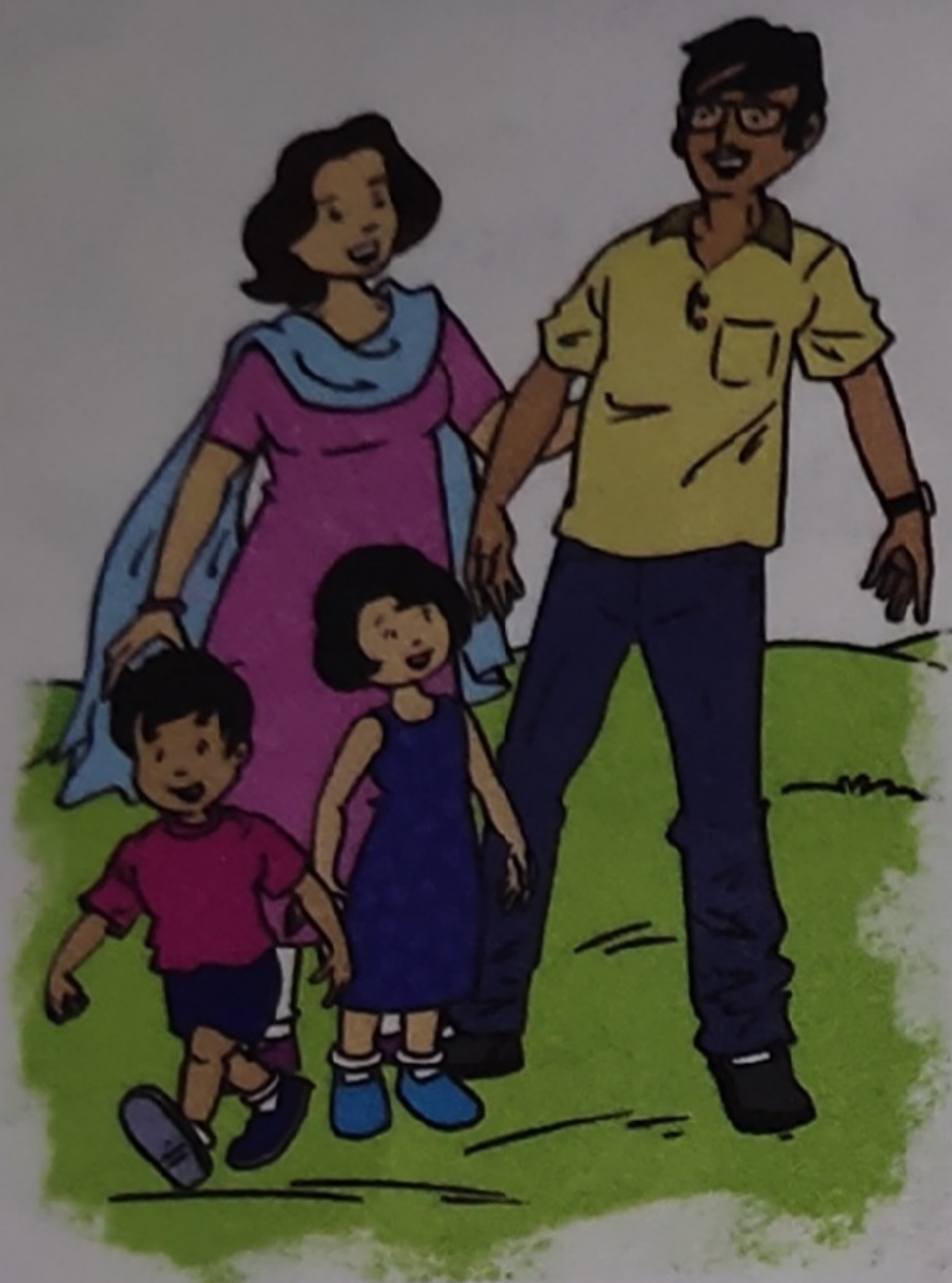
▲ A nuclear family