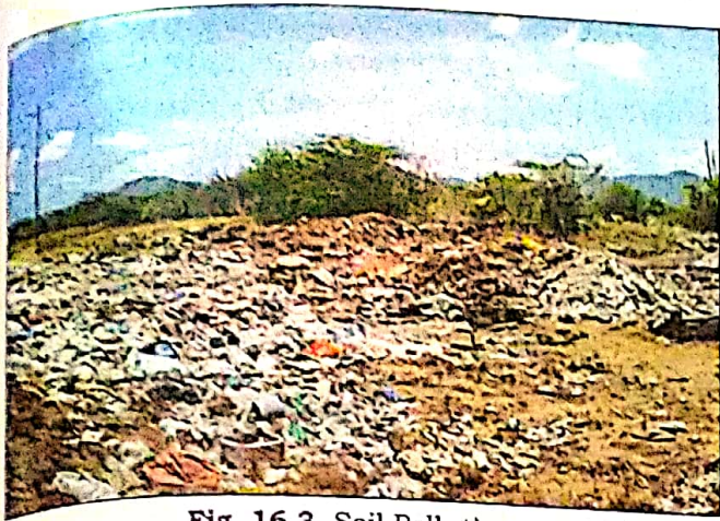
Fig. 16.3. Soil Pollution

affected by thermal pollution and other water pollutants such as oil spills and nuclear waste.