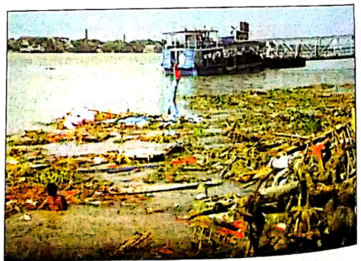
Fig. 16.2. Water Pollution

Marinewater. Marine pollution or Ocean Pollution is the spreading of harmful substances such as oil, plastic, industrial and agricultural waste and chemical particles into the ocean. Eighty per cent of marine pollution comes from land. Mining for materials such as copper and gold is a major source of contamination in the ocean. The saline water in the oceans also get