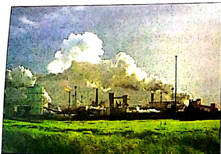
Fig. 16.1. Smoke from factories

Air pollution takes place through the pollutants of gas, solid and liquid particles of both organic and inorganic chemicals. Gases such as sulphur dioxide, carbon monoxide, hydrogen sulphide, pollens from plants, etc., are continuously