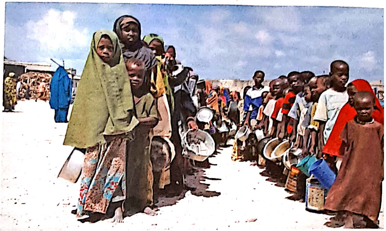
Fig. 3.3 The Somalia Famine (2010-2012)