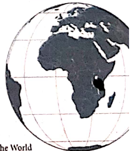
Fig. 3.4 Location of Canada and Tanzania in the World